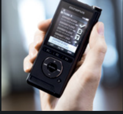
With the DS-9500, even when you're on the go, you can send your dictations over WiFi to your chosen email recipients.